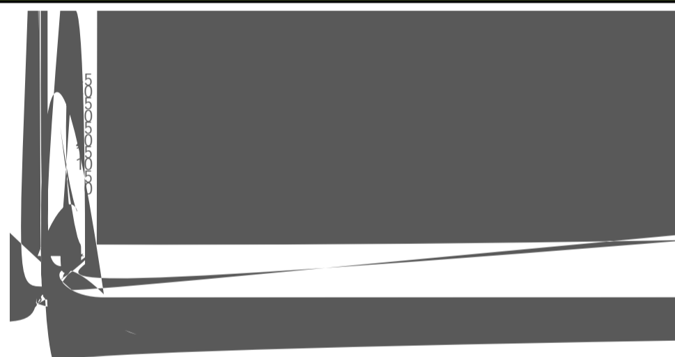
Figure 3: A comparison of total frog captures per trap session. See table 1.